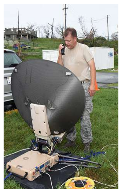
A National Guardsman assists in communications support for first responders and government agencies after Hurricane Maria.