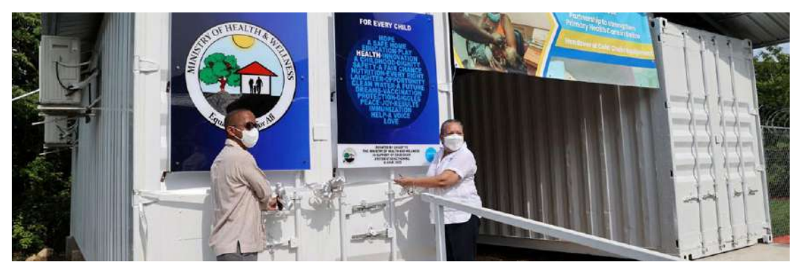
Cold chain equipment is delivered to the Belize Ministry of Health and Wellness.

The team is now helping to deliver samples from rural community clinics that offer prenatal care. Obstetric panels are used to identify health problems in pregnancy, looking for diseases and infections that can affect the health of a woman and her unborn baby. The results guide treatments to improve the quality of life for patients and their families.