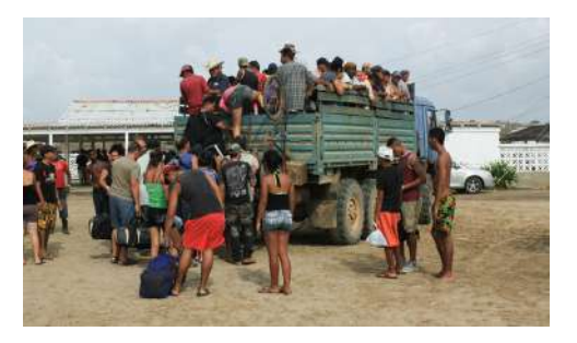
Central American refugees board a truck in Tapachula, Mexico.

CARA's work delves deeper, exploring the individual experiences of poverty and human dignity: migrants' perceived ability to deal with difficulties, mental wellbeing, and psychological resilience.