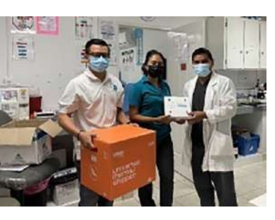
Biological samples and reagent kits being transfered to Belize's national reference laboratory.