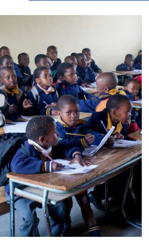
Above and right: Transition-to-English Plus (T2E+) in Ghana was one activity the Pulte Institute evaluated to gauge whether it met the minimal benchmarks to improve reading performance for primary-grade learners. The phonics-based program taught students how to read by connecting letters associated with words to corresponding sounds.