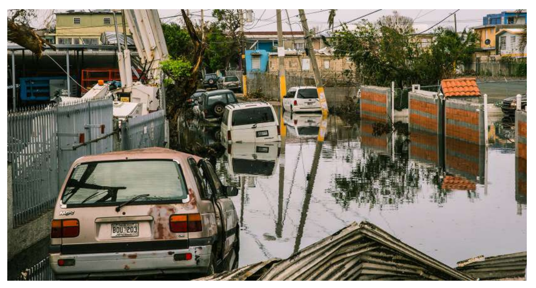
Flooded streets in San Juan, Puerto Rico, after Hurricane Maria devastated the island.

The findings also highlight the importance of looking at social and demographic data to help identify vulnerable populations, such as older adults or those with disabilities, who may need additional support during and after a storm.