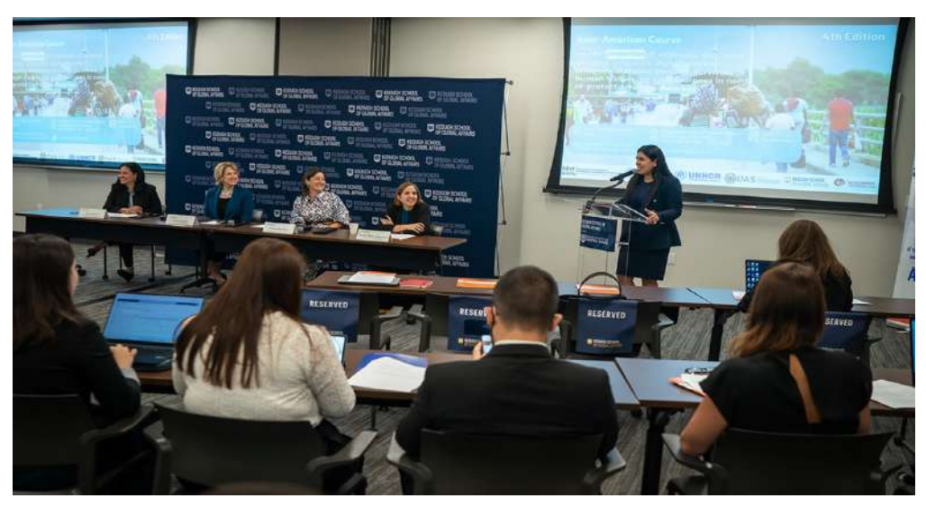
The Keough School, its Pulte Institute for Global Development, and the Organization of American States shared insights and perspectives with officials on the frontlines of defending migrants' rights.

At the Keough School's Washington Office in June, speakers analyzed the dynamics and root causes of migration, asylum, human trafficking, and forced displacement in the Americas and the protective factors that allow people to stay in their country or region. They also explored how emigration affects women and girls, and how international organizations can shape public support for policies that help integrate migrants.