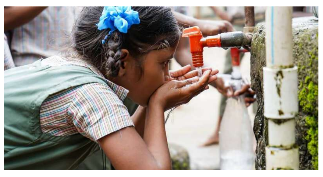
Pulte Institute research finds that water, sanitation, and hygiene (WASH) are essential to the fulfillment of women's rights as well as their economic and social development.