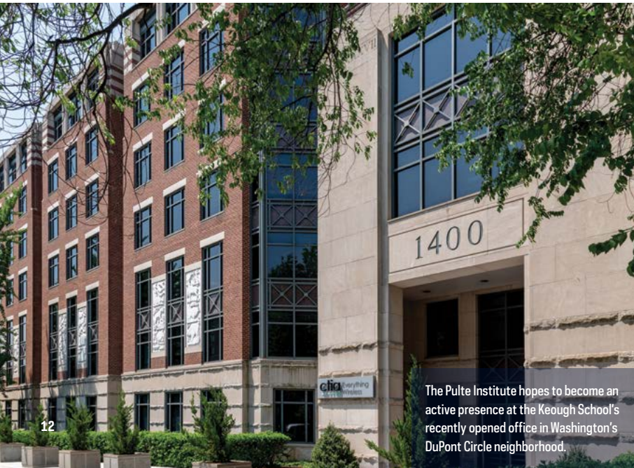
The Pulte Institute hopes to become an active presence at the Keough School's recently opened office in Washington's DuPont Circle neighborhood.