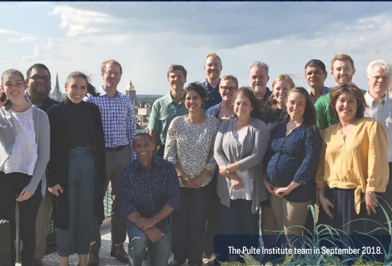
The Pulte Institute team in September 2018.